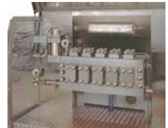
Liquid End (Gaulin)