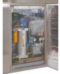
Oil and Hydraulic Units