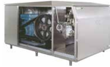
Transmission (Power End)

We will be happy to discuss any other requirements you may have.