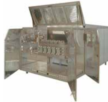
Access to the Homogenizing